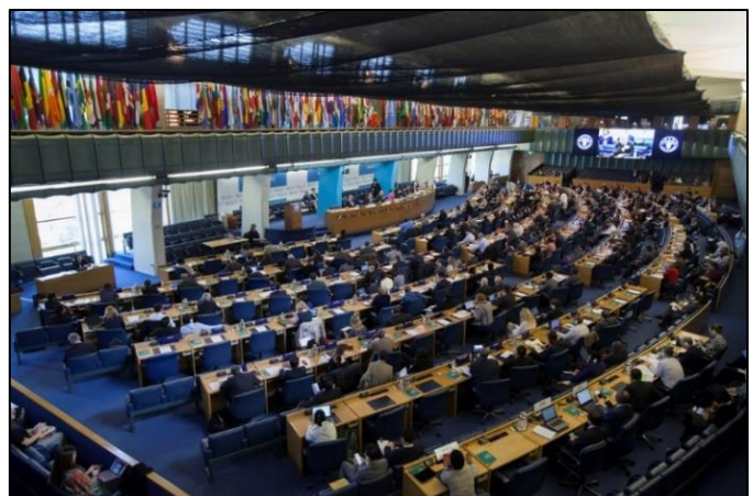
The IPPC Commission on Phytosanitary Measures is the forum for adopting final ISPMs and other international protocols.